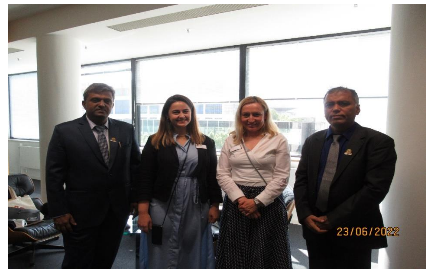
Meeting was also held with Heimtextil Team of MesseFrankfurt