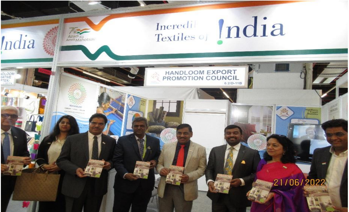
The Secretary (Textiles) also released the exhibitors catalogue brought out exclusively for the event by the HEPC